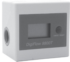
Two AAA alkaline batteries are included.

Installations must comply with appropriate plumbing codes. Do not use vinyl tubing to connect any Water, Inc. Product to a water source. Polyethylene tubing is recommended for cold water applications.