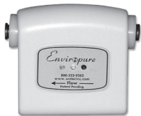
Two AA alkaline batteries are included.

TEMPERATURE: 32-176°F / PRESSURE: max. 80 psi / WEIGHT: 5.38 oz / Connection: 3/8" NPT female