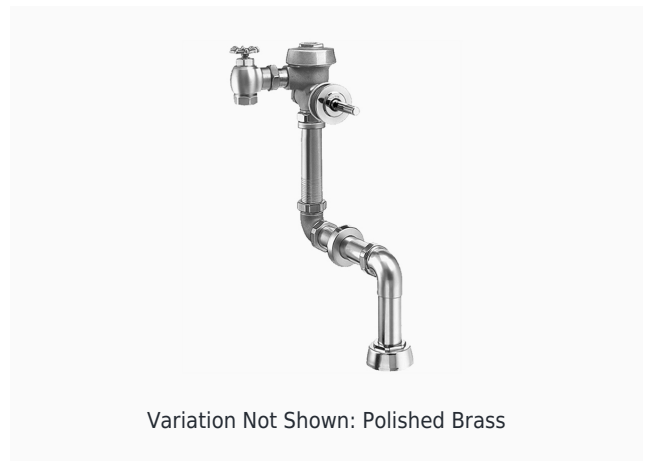
Variation Not Shown: Polished Brass