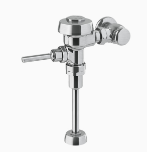
Variation Not Shown: Brushed Stainless