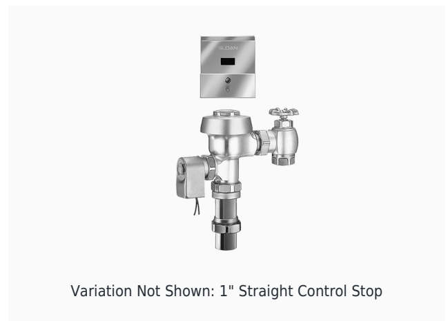
Variation Not Shown: 1" Straight Control Stop