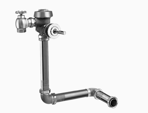
Variations Not Shown: 1" Straight Control Stop and Metal Index Push Button