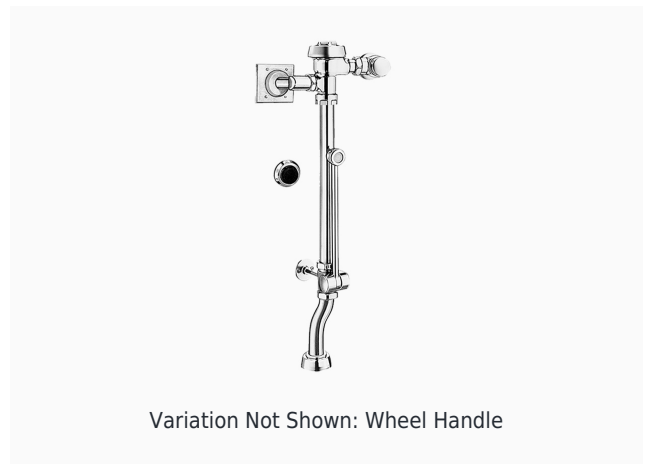
Variation Not Shown: Wheel Handle