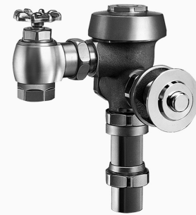
Variation Not Shown: Front of Valve Handle