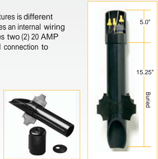
Cut-away shows wiring connections inside the SplicePost Cap.

The PVC SpliceCap is non-metallic and suitable for the majority of outdoor lighting fixtures on the market.